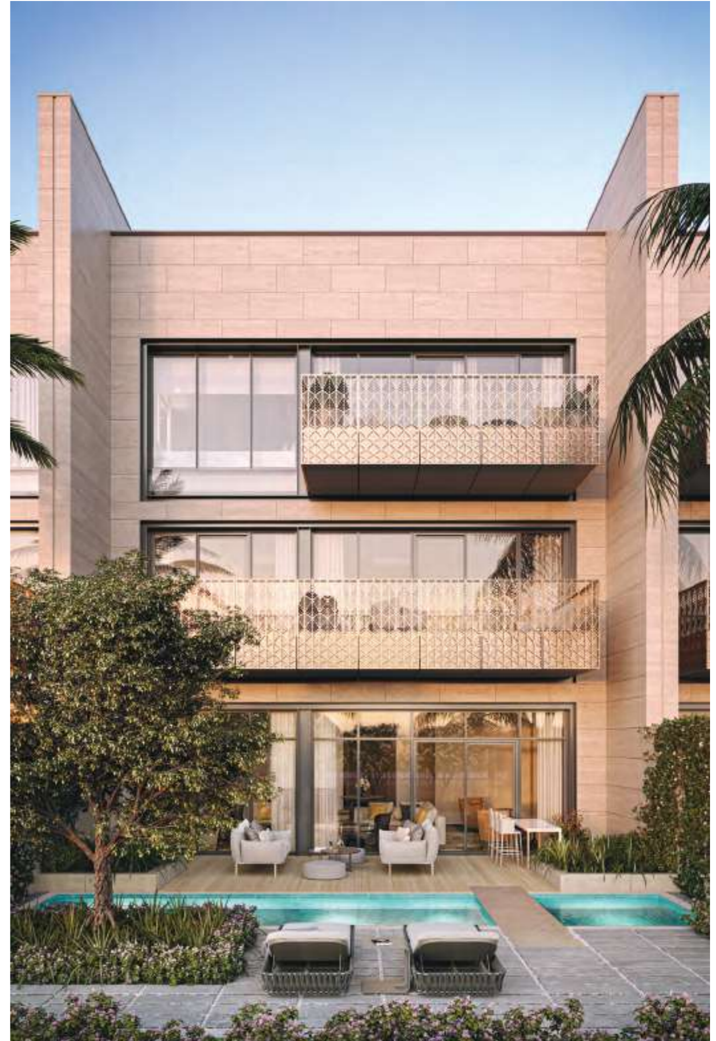
GARDEN TERRACE AND POOL

The grand-scaled living and dining rooms open onto the lushly landscaped pool and garden oasis making these amongst the most desirable private entertaining spaces in Dubai. On the upper bedroom levels, expansive balconies offer private havens overlooking the Water Canal and downtown skyline.