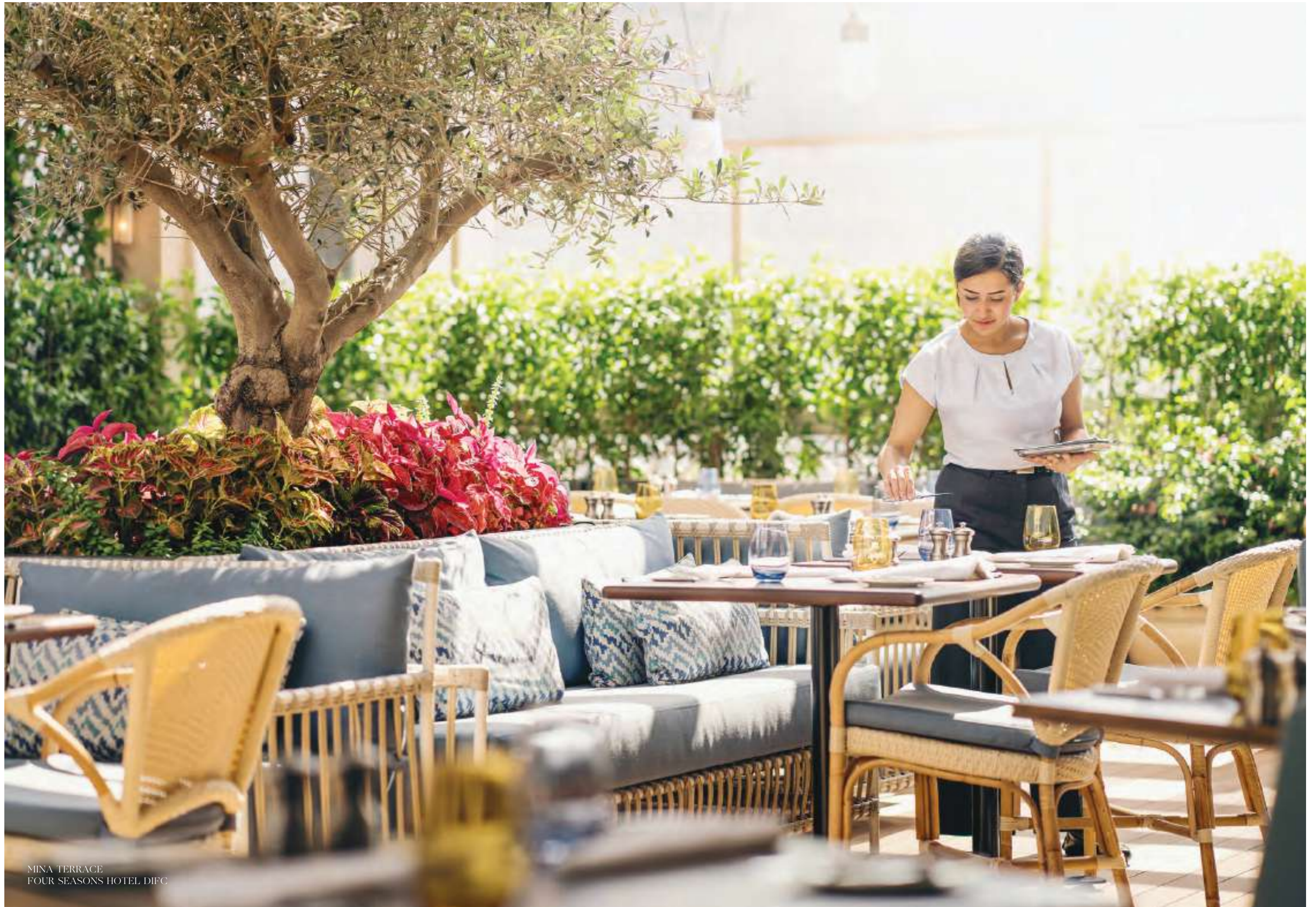
MINA TERRACE FOUR SEASONS HOTEL DIFC