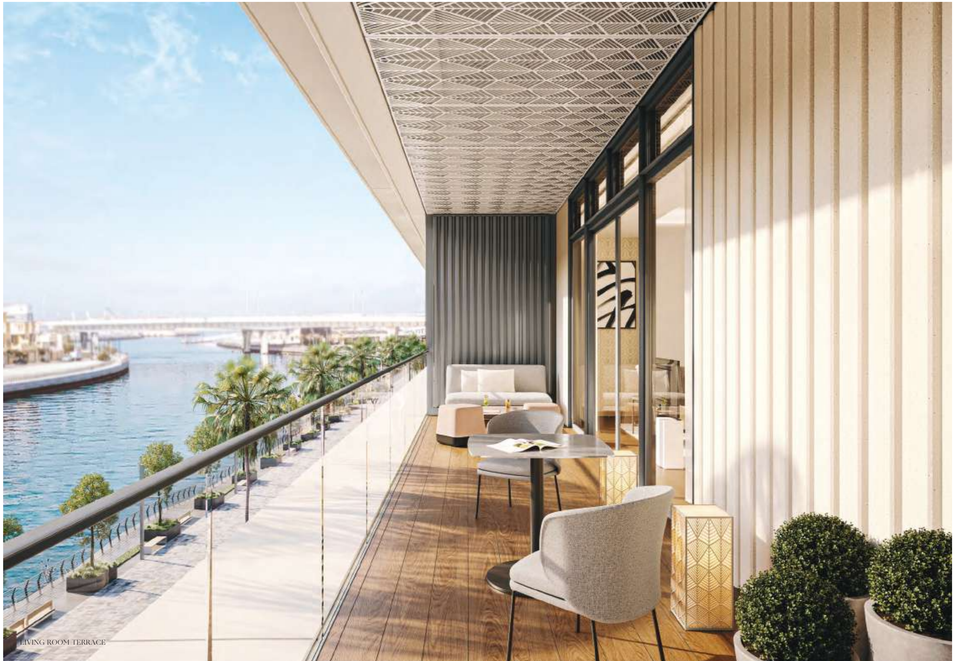
LIVING ROOM TERRACE